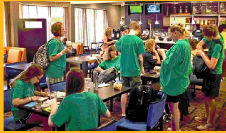
We had a great time solving riddles and asking probing questions to get to know each other better over great food (my favorite part!)