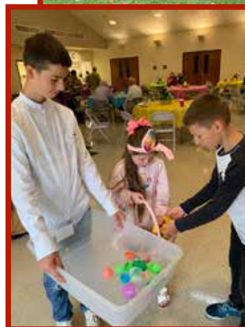
A few photos from the Egg Hunt on Easter Sunday.