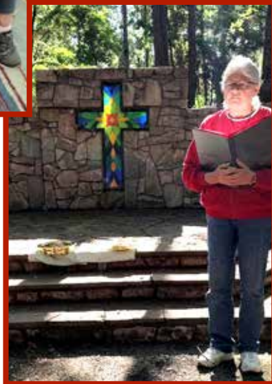
Photos from the Women's Retreat at Trinity Pines on April 14.