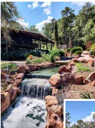
Trinity Pines Conference Center on Lake Livingston.

Questions please contact Marsha Bower 281-381-0515