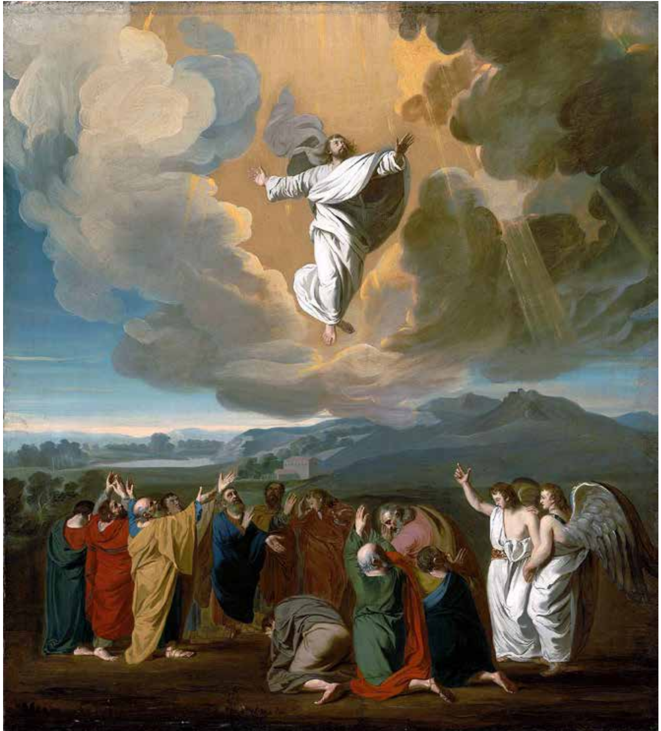
Jesus' ascension to Heaven depicted by John Singleton Copley in Ascension (1775)