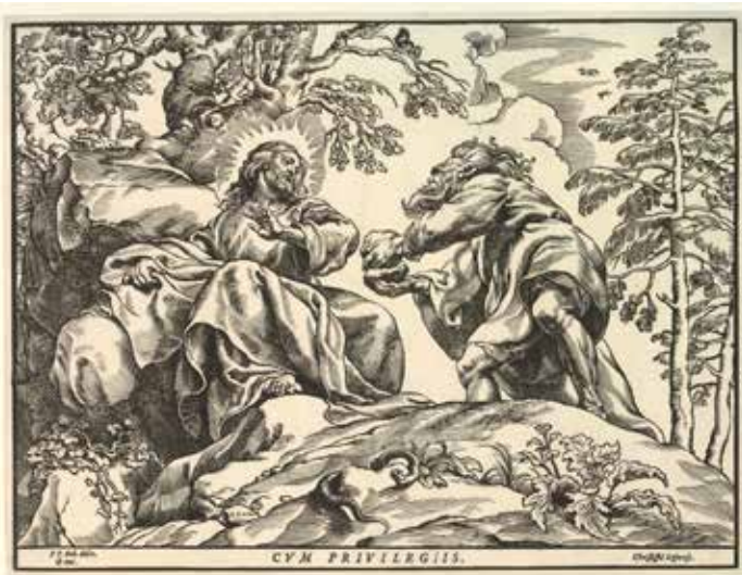
Temptation of Christ in the Desert, 1633 Woodcut, British Museum