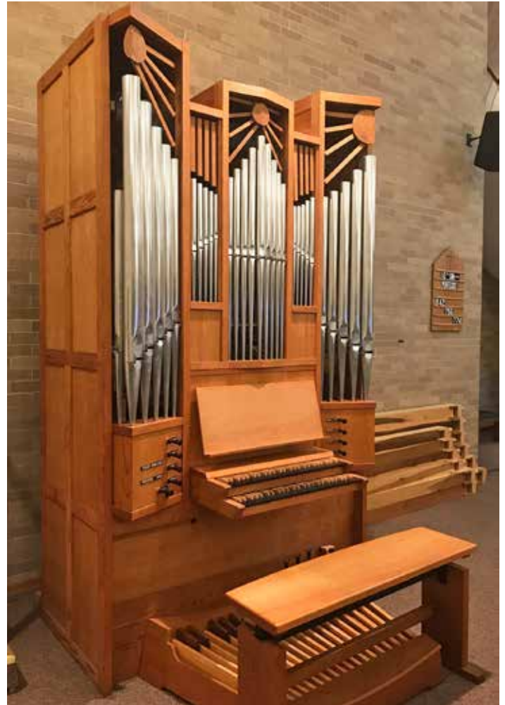
The new Visser-Rowland organ being installed in the Sanctuary. Dedication will be September 17.