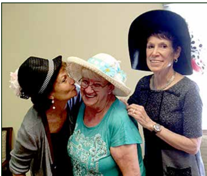
Easter hat making 2016