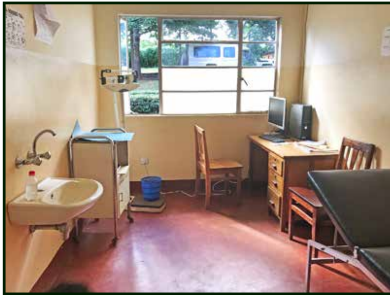
Photos of the Karatu Hospital