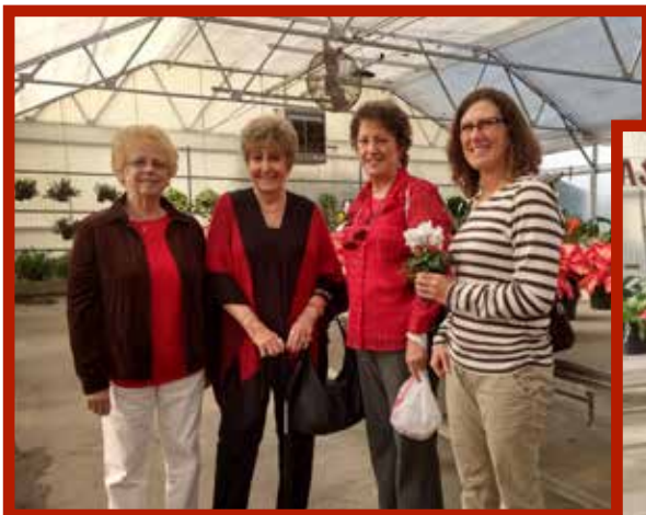
Lunch at Brookwood in December

To grow in our relationship with God and each other through worship, fellowship, discipleship, ministry and evangelism